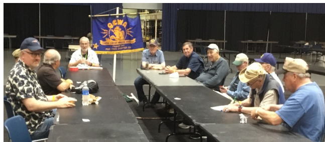
QCWA Maine Pine Tree Chapter held their meeting on the convention floor

Various clubs and ham radio interest groups were given tables to promote their interests too.