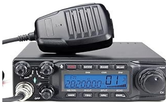
10- Meter AT-6666PRO FM/AM/USB/LSB Only a year old with low activity